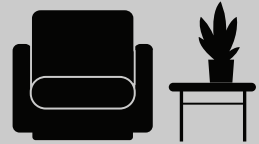
Chairs & Tables